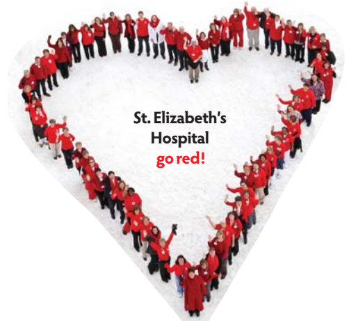
St. Elizabeth's Hospital go red!