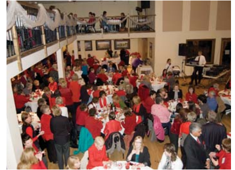
St. Elizabeth's Hospital, IL celebrates National Wear Red Day