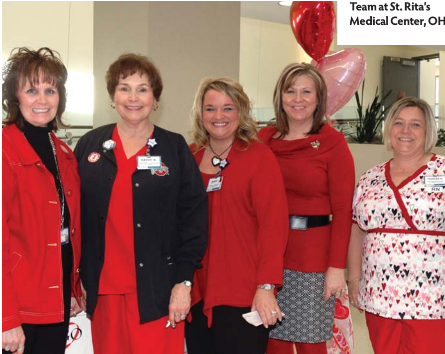
Team at St. Rita's Medical Center, OH